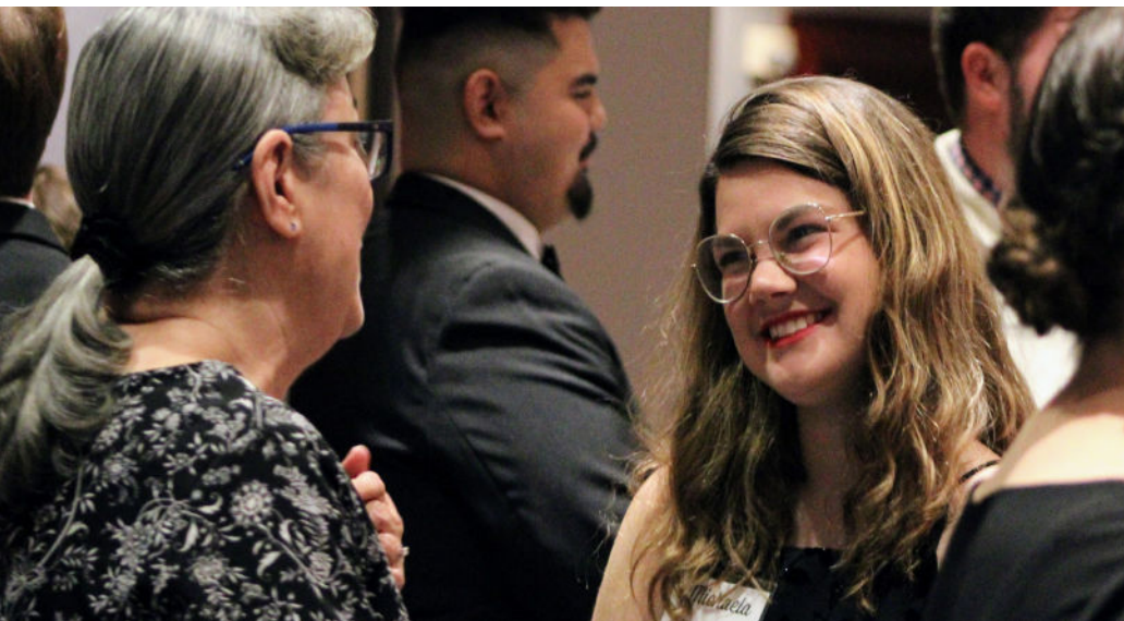
Students, faculty, staff, alumni, and friends of Calvary had the chance to fellowship together at the President's Dinner on September 29, 2022.